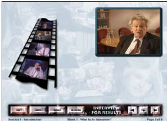
Sir Ludovic Kennedy explains interview technique using a number of video examples